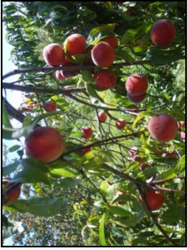
Peaches from Millie's Organic Garden