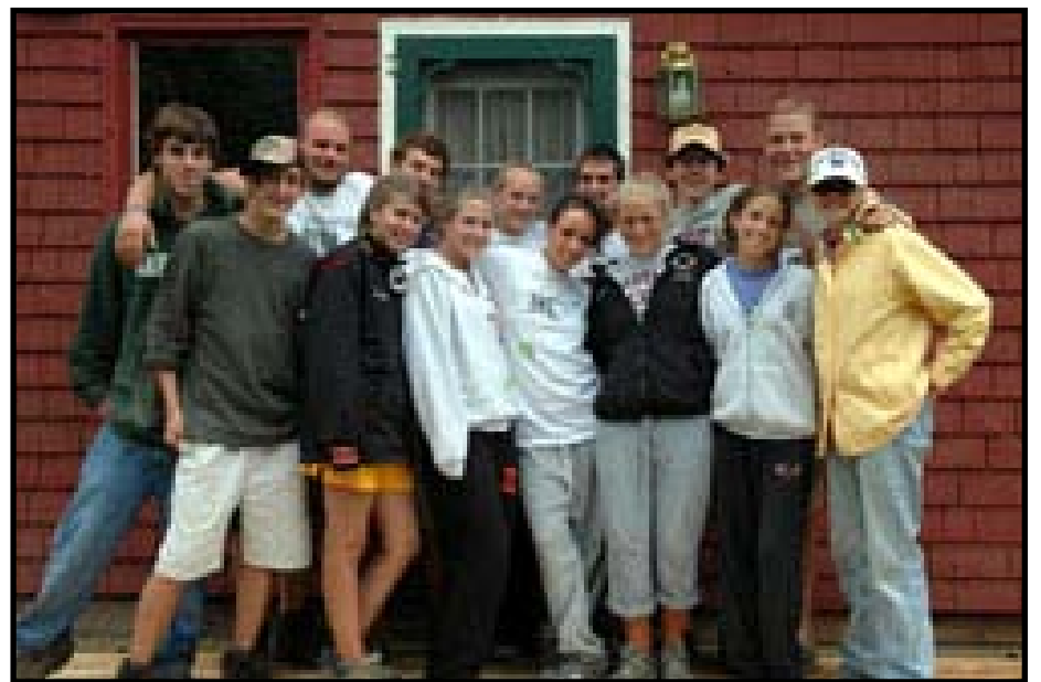
Volunteers from Ridgefield Connecticut