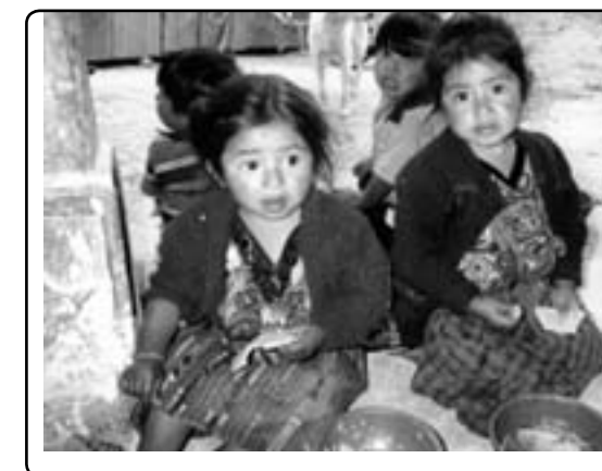
Children from the village of San Juan Comalapa