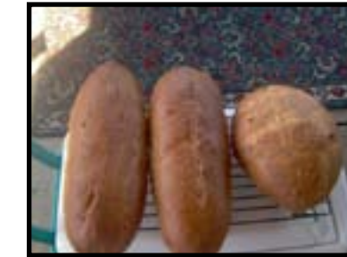
Bread from H.O.M.E. Bakery