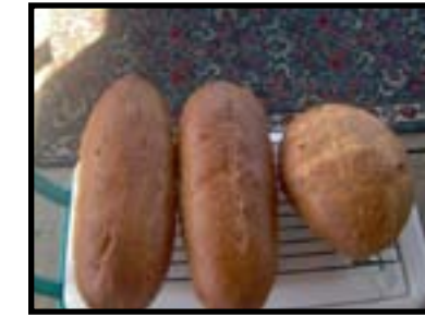
Bread from H.O.M.E. Bakery