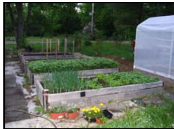
Square Foot garden bed.

It's a lot of work and expense to build a bed, but once built you'll get years of great harvests for very little work compared to a regular garden system.