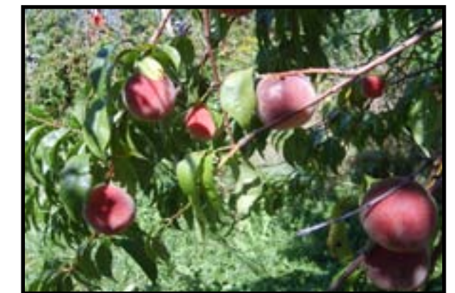
Peaches from Millie's garden